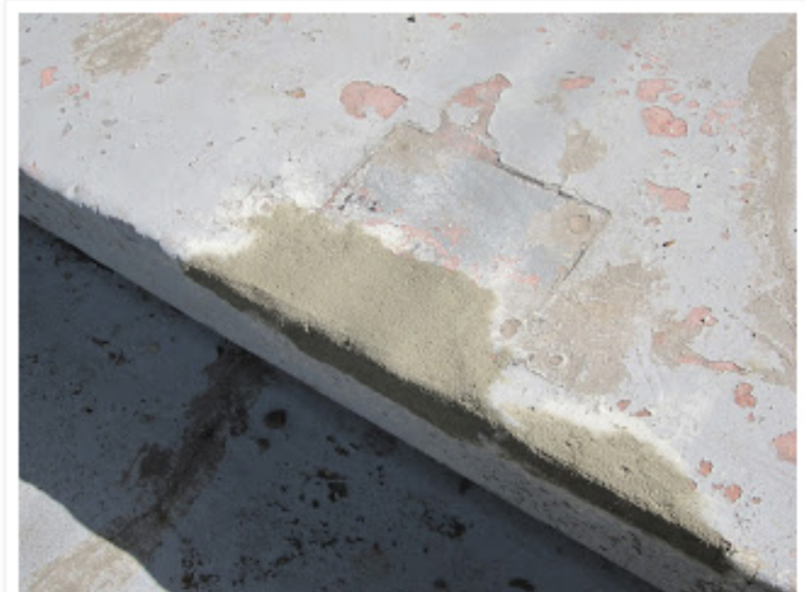
[Still wet but whole!]

Call me weird but I enjoy spackling (and mudding), getting it all nice and even. I applied the concrete mix in layers, making sure to press the first layer firmly against the old concrete to ensure a good bond, and then building it up to form the step's edge. The instructions said that the mix would remain workable for 20 minutes, and that's exactly what it did.