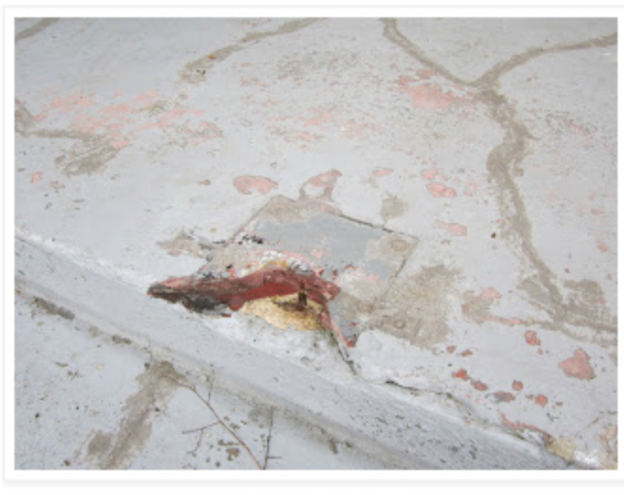
[Oy ... not pretty]

Unfortunately removing the handrail left behind a crater where the rusted bolts along with the movement from a half-loosened railing had broken out part of the concrete of the porch. Meh! It looked like a gnarly monster had taken a bite out of our porch's front edge. Fair warning, those pictures aren't pretty and they don't really improve much at the end of this little project. Flaky paint never makes anything look pretty, and the paint job on our porch is definitely failing or rather, rubbing off and revealing a red underlayer. We have plans to powerwash, sand and re-paint, once we're completely sure which colors to paint our house.