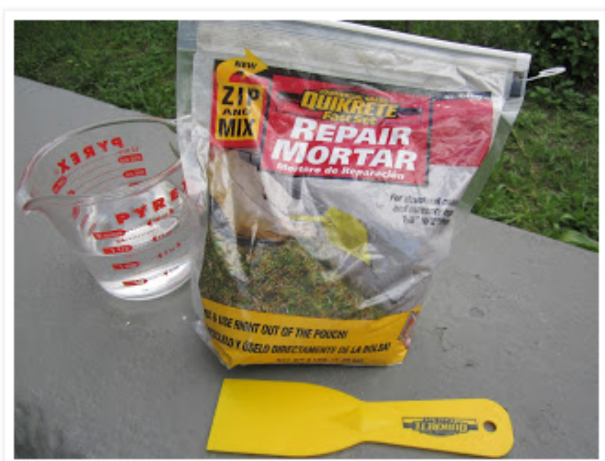
[It's in the bag ... including the yellow spackle spatula]

Luckily, HGTV came to the rescue. Ever since buying the house and embarking on DIY project after DIY project and learning that, no, a lot of things take waaaay longer than a weekend (because you don't have a 30-man crew as a back-up), my relationship with HGTV has been a bit strained. This has led to a severe reduction in HGTV consumption on my part but fortunately I tuned in on one of those Home and Patio show episodes where they introduced Quikrete's repair mortar in a ready-to mix pouch. "Add water, knead, apply, done!" sounded just like what I needed, especially the repeated confirmation that it would indeed stick to and bond with existing concrete.