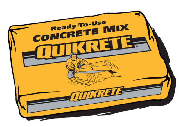
Concrete Mix When representing QUIKRETE<sup>®</sup> concrete products