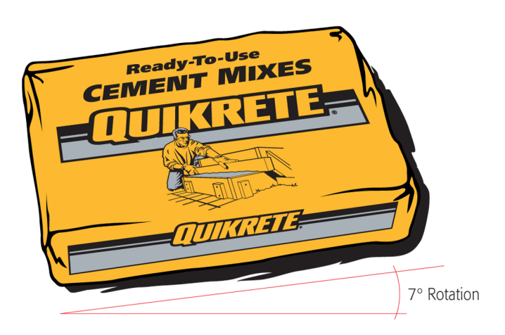
Cement Mixes When representing the entire line of QUIKRETE<sup>®</sup> products