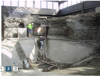
Great Lakes Concrete Restoration applied more than 50 3,000-pound bulk bags of Quikrete Shotcrete MS over a rebar frame in the 80,000-gallon solarium pool.

Like 0 Tweet 0 +1 0 LinkedIn 0 Comments Print 0