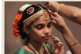
India Fest celebrates India's independence from British rule